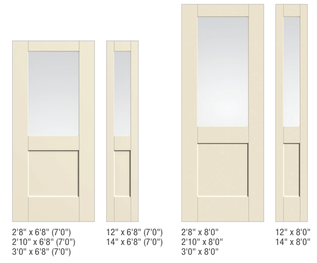
7'0" sizes available Q4 2024.