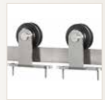
top mount SPECIAL ORDER