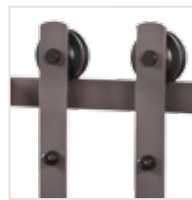
straight strap SPECIAL ORDER